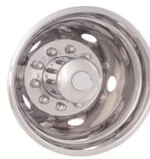
17" or 19.5" Stainless Steel Wheel Covers (Front & Rear) (Opt. on XL and XLT) – 945