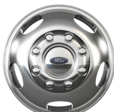
17" Forged Polished Aluminum w/bright hub cover/center ornament (Std. on Lariat F-350; Opt. on XL and XLT F- 350) – 64J