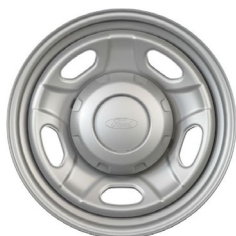
17" Argent Painted Steel w/painted hub cover/center ornament (Opt. on XL and XLT) – 64A