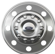
19.5" Forged Polished Aluminum w/bright hub cover/center ornament; 19.5"x6" (Std. on Lariat F- 450 and F-550; Opt. on XLT F-450 and F-550) – 64D