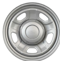
18" Argent Painted Steel w/painted hub cover/center ornament (Std. on XL F-350 SRW) – 64F