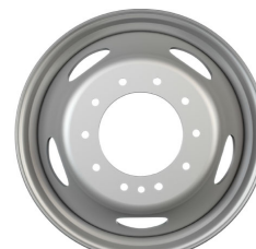
19.5" Argent Painted Steel (19.5"x6"; hub cover/center ornament not included; Std. on XL and XLT F-450 and F- 550) – 64Z